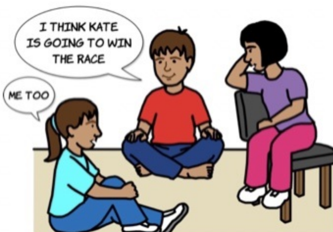
Share thoughts and ideas