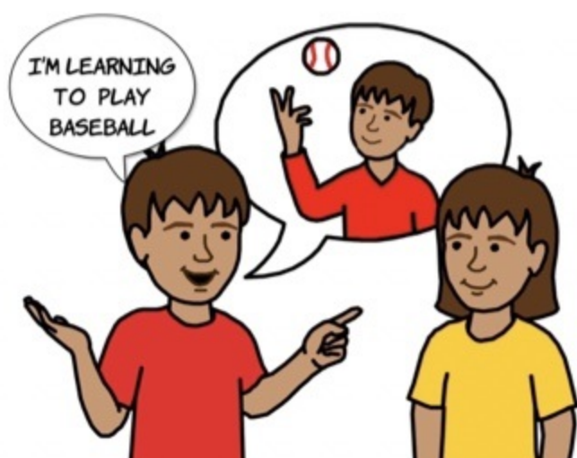
Share personal experiences