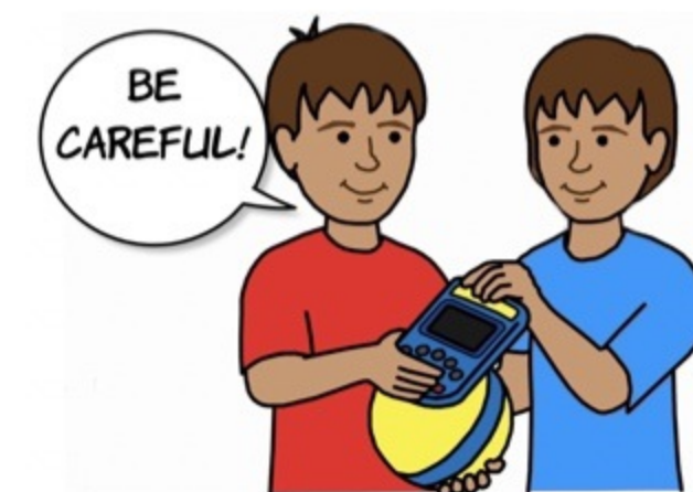
Direct other's actions